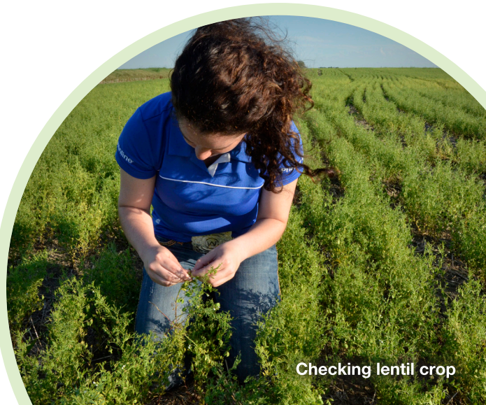
Checking lentil crop

Just because you see lots of the same type of crop in many adjoining fields doesn't mean that farmers don't rotate their crops. They may grow the same crop in many of their fields one year, and a different type of crop the following year.