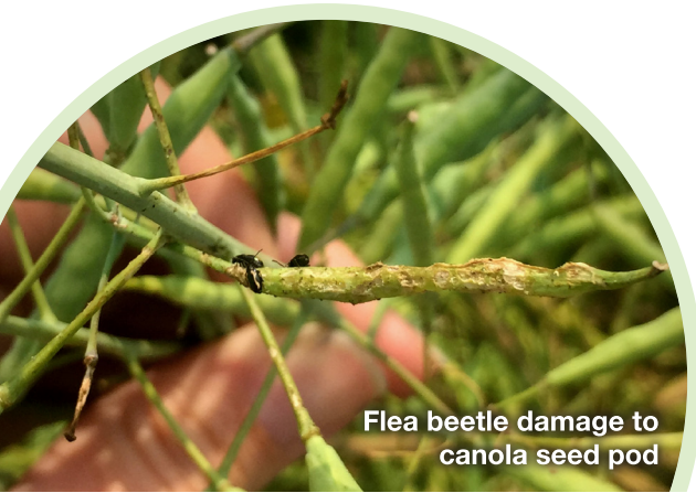
Flea beetle damage to canola seed pod