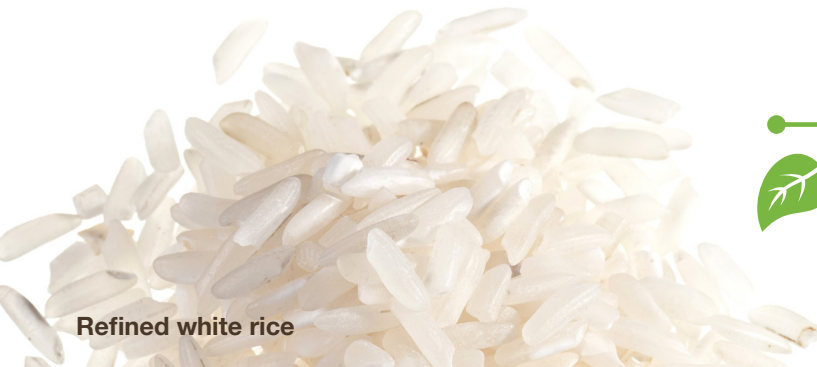
Refined white rice